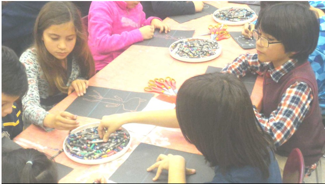
Fieldtrip to the Fresno Art Museum, 2017